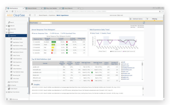
User Quality of Experience Dashboard